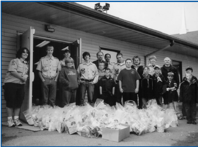
Shawano Area Cub and Boy Scouts were recently welcomed as a new member of the Shawano Country Chamber of Commerce. They are shown with the food collected from the 2008 Annual Food Good Turn Project after collecting food for SAFPARC.