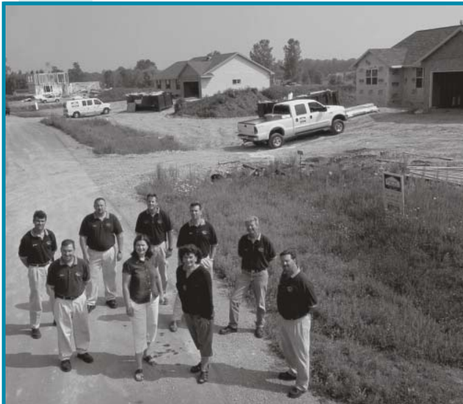
Perret Homes Inc. of Green Bay was recently welcomed as a new Chamber member.