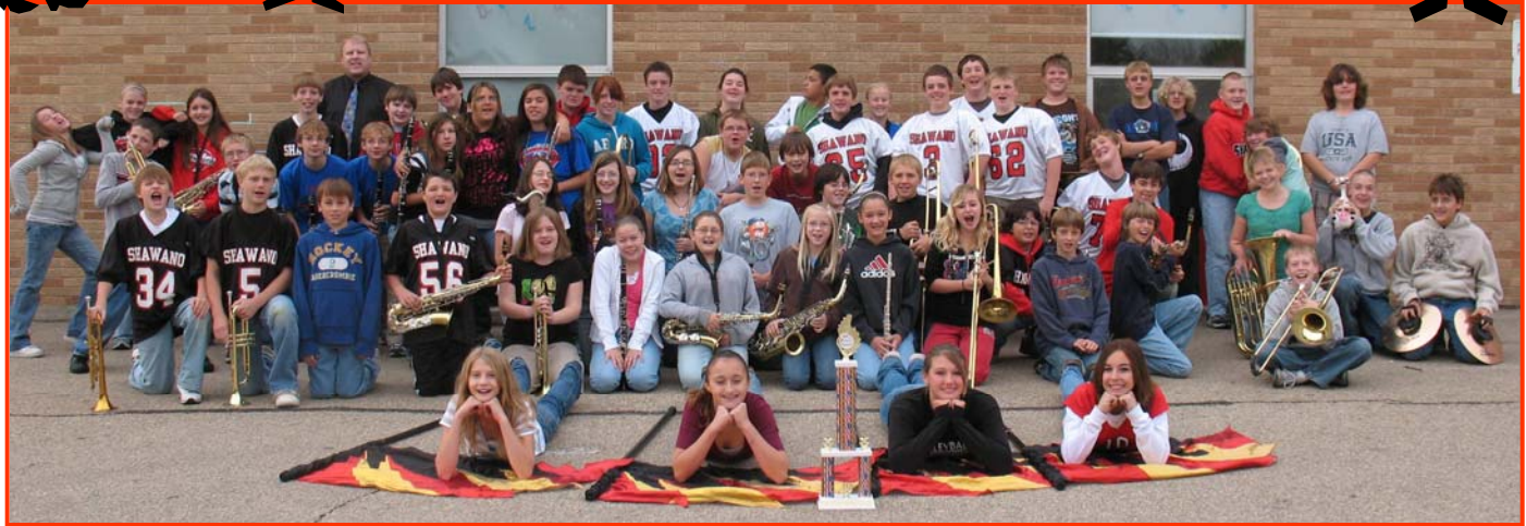
Best of Parade—Shawano Community Middle School Band